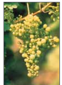
Zinc Deficiency in Grapes

The ribosome is the site of protein synthesis within the plant cell. Zinc is a structural component of the ribosome. In the absence of zinc, the ribosomes disintegrate. In the meristematic regions of plants; i.e. the shoots and pollen tube, zinc content must be at least 100 ppm, which is essential for the maintenance of protein synthesis. This level is five times the level needed