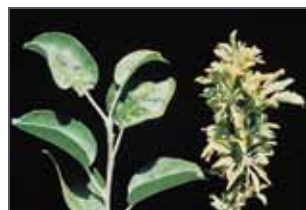
Little Leaf in Apple Caused by Zinc Deficiency

The most characteristic visible symptoms of zinc deficiency in dicots are stunted growth due to shortening of internodes