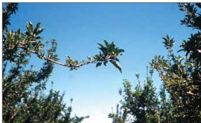
Zinc Deficiency in Apple

In plants zinc is taken up in the Zn^{2+} form. At this time it still remains unclear whether this uptake is facilitated as diffusion through membranes specific for Zn^{2+} or whether it is mediated by specific transporters. The possibility exists that both mechanisms are utilized by plants for zinc uptake. Work done in the 1970's concluded that 90.5% of