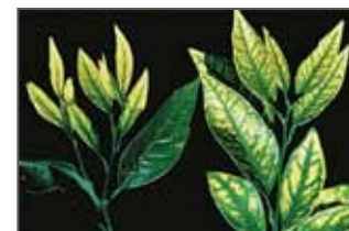
Little Leaf Rosette and Chlorosis in Citrus

(rosetting) and a drastic decrease in leaf size (little leaf) as shown in the pictures in this newsletter.